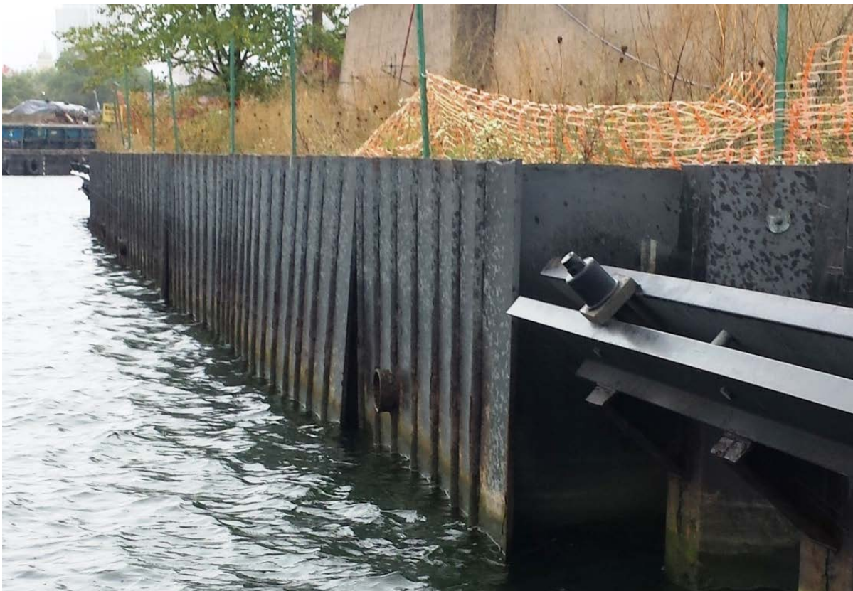
Photo 16 Phase 3 Southern bulkhead cantilevered HZ piles with separated interlocks at two locations

On the south facing bulkhead, there are 2 locations along the section of cantilevered HZ-piles where the interlocks have split. At the top, the interlocks are touching, but are not threaded together. At the bottom near the mudline, the interlocks have been pushed out of alignment by approximately 12". This most likely happened during construction, perhaps when the pile was being driven, there may have been an obstruction that caused the pile tip to kick out of alignment. Review of the archive As-Built drawings indicated that HZ piles D44, D45 and D53 encountered refusal or were terminated above design tip elevations with D53 being the most extreme with actual tip elevation of -26.3' versus a design tip elevation of -66.5'. The interlock separations found, do not correspond with the early terminated HZ piles noted, and the As-Built notes do not mention separated interlocks or field repairs. The diver reached into the interlock separations and found hard surfaces, not soil, it appears that repairs were inserted into the web pockets between these piles. The easternmost HZ pile, D1, was driven slightly outward and overlapping pile D2, but the gap had been sealed and may have just been an end termination transition fit.