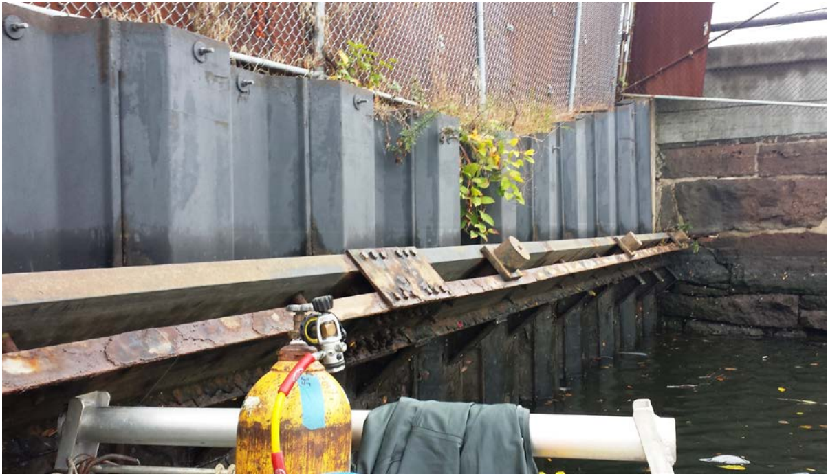
Photo 5 Phase 2 East at Grand Avenue, note coating deterioration on wale

The East Bulkhead, however, has some bulkhead coating loss in the tidal and splash zones. There are more widespread coating losses, especially in the area closest to Grand Avenue.