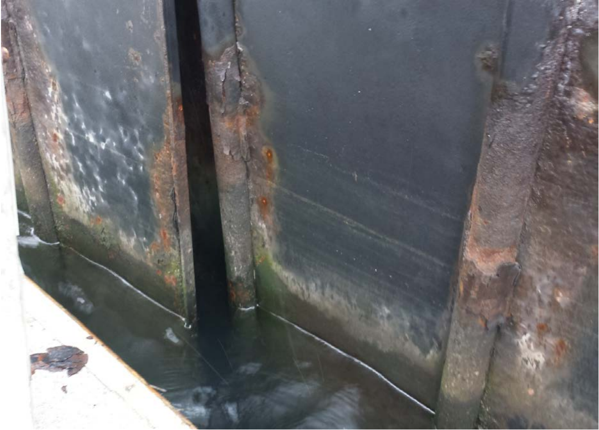
Photo 17 Phase 3 Separated interlock at water surface between piles D7 and D8

The western length of Phase 3 bulkhead has similar conditions with localized coating deterioration and onset of corrosion on the sheet piling, wales and tiebacks to vary degrees, primarily in the tidal and splash zones. There are small isolated areas of coating loss and slight corrosion, but the UT thickness testing shows full sectional area.