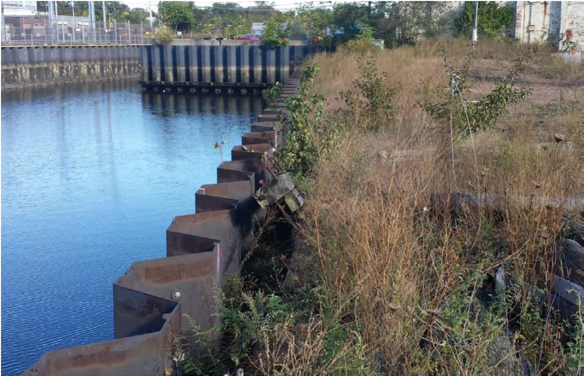
Photo 1 Phase 1 Bulkhead, minor coating deterioration inshore face

As was mentioned in 2.2 above, the coating showed some signs of localized coating loss in isolated areas, as expected for a structure of this age in a marine environment.