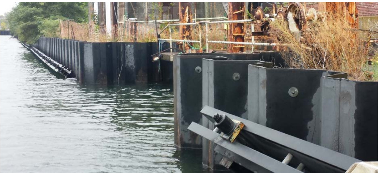
Photo 18 Phase 3 Western bulkhead at intake tunnel with localized coating deterioration and corrosion onset in the tidal and splash zones

The western length of Phase 3 bulkhead has similar conditions with localized coating deterioration and onset of corrosion on the sheet piling, wales and tiebacks to vary degrees, primarily in the tidal and splash zones. There are small isolated areas of coating loss and slight corrosion, but the UT thickness testing shows full sectional area.