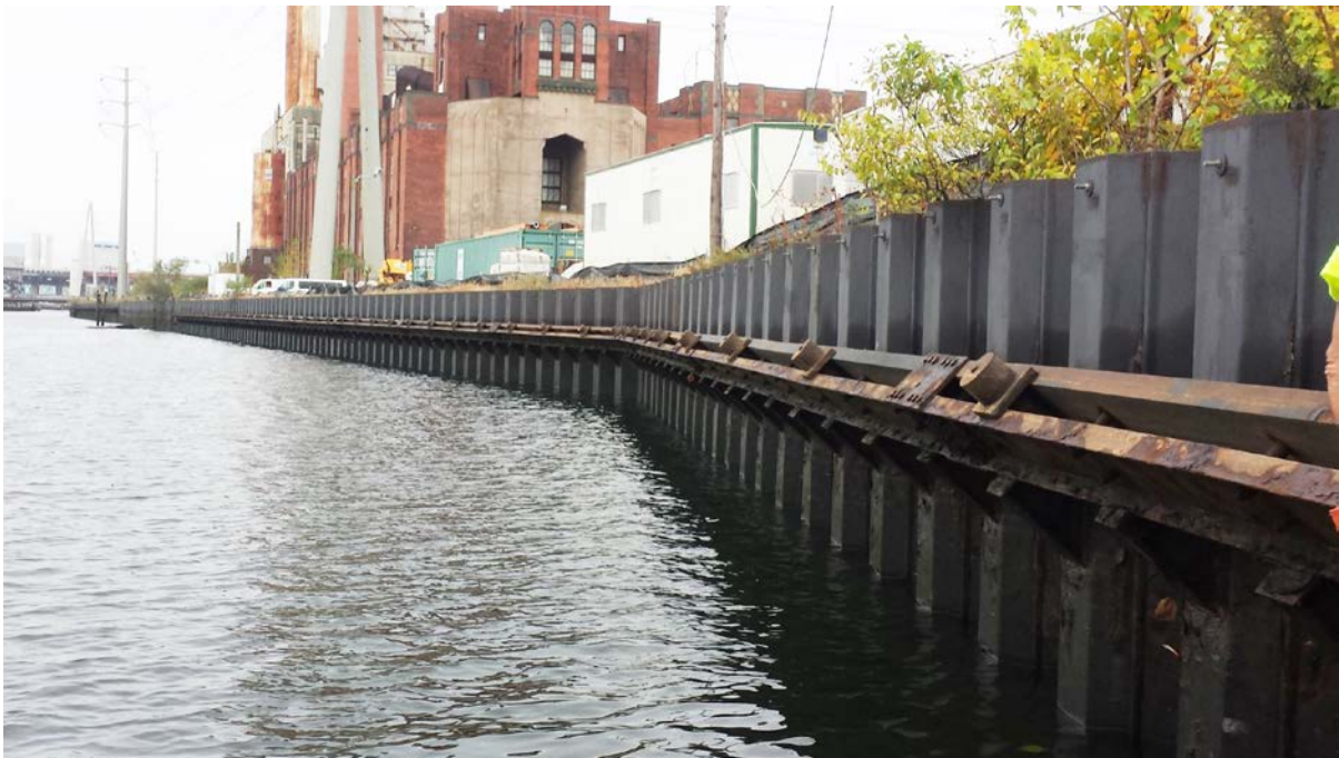
Photo 6 Phase 2 East looking south, note coating deterioration on wale

The Phase 2 East Bulkhead is supported with tiebacks, which are typically angled down at 40° through a prior concrete relieving platform except for the bulkhead in front of the