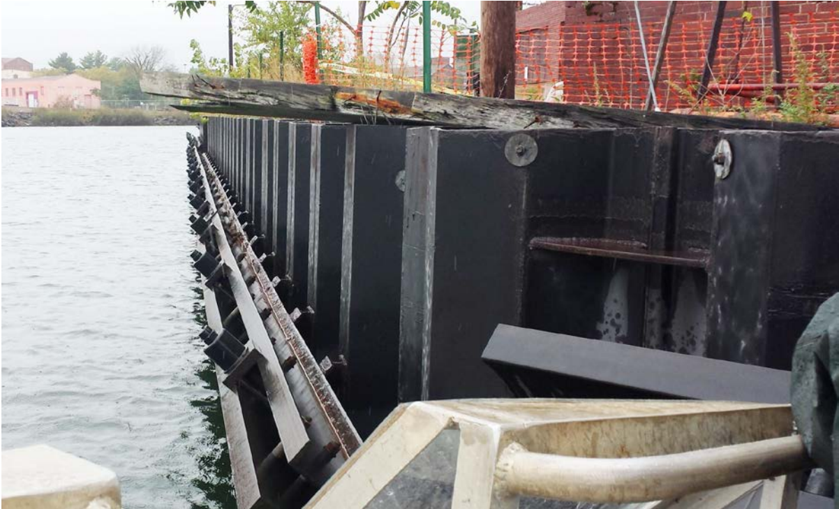
Photo 9 Typical Phase 3 angles down ground anchors with Phase 3 grease caps

The sheet pile bulkhead constructed in Phase 3 is similar in construction to the Phase 2 bulkheads. Most of the Phase 3 sheet piles are tiebacks, which are typically angled down at 40° through a prior concrete relieving platform (existing modified, or new).