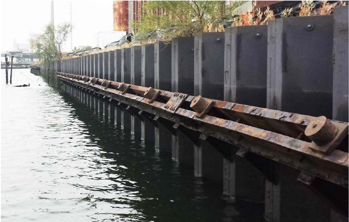
Photo 7 Phase 2 East, looking south, note coating deterioration on wale

foundation for the high-tension wires and continuing to the L.P. Discharge Channel, where horizontal tiebacks connect to the relieving platform that was strengthened in some areas. There is no evidence of failure along the length of the Phase 2 East Bulkhead, but the wale coating shows signs of deterioration. Based on the UT thickness tests, the sheet piles are still very close to full sectional area.