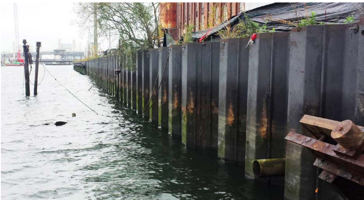
Photo 8 Phase 2 East, south end with sunken boat adjacent to bulkhead