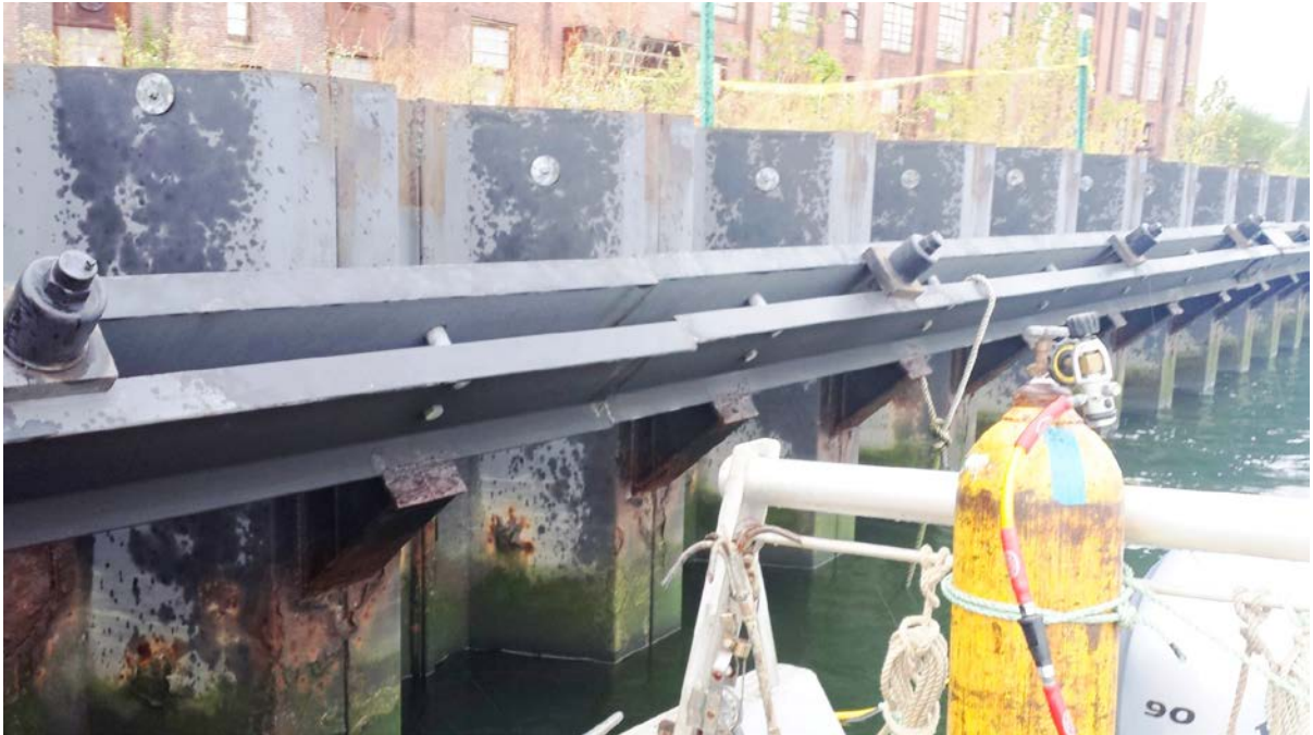
Photo 10 Phase 3 East typical coating deterioration localized in the splash zone, primarily at field welds with coating touch-ups