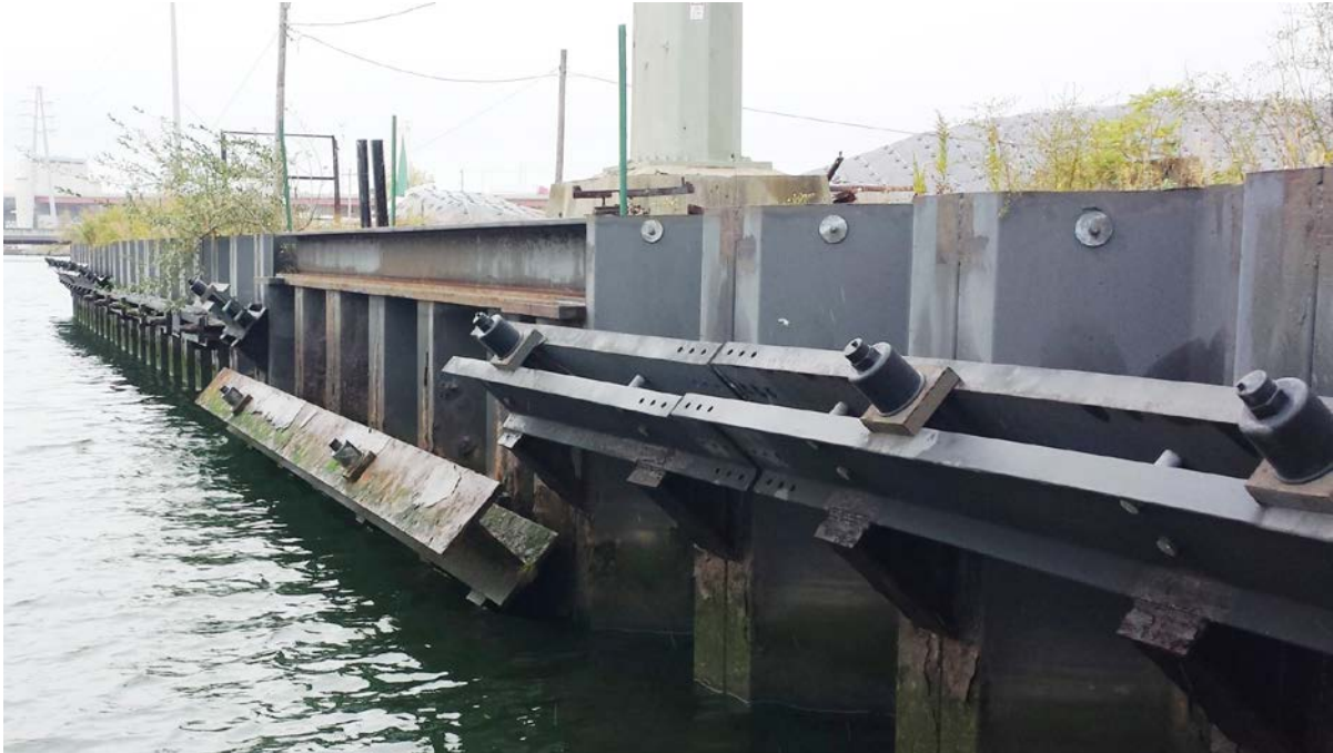
Photo 14 Phase 3 wale missing splice plates between Unit 7 and 8 discharge structures

The short length of bulkhead in between Unit 7 and Unit 8 discharge structures has a wale missing splice plates. Observation of the wale coating suggests the wale splice plates were never installed. The wale is welded to the angled mounting brackets on both sides of the splice, and this is not noted in the As-Built drawings, suggesting it was accepted by the engineer of record.