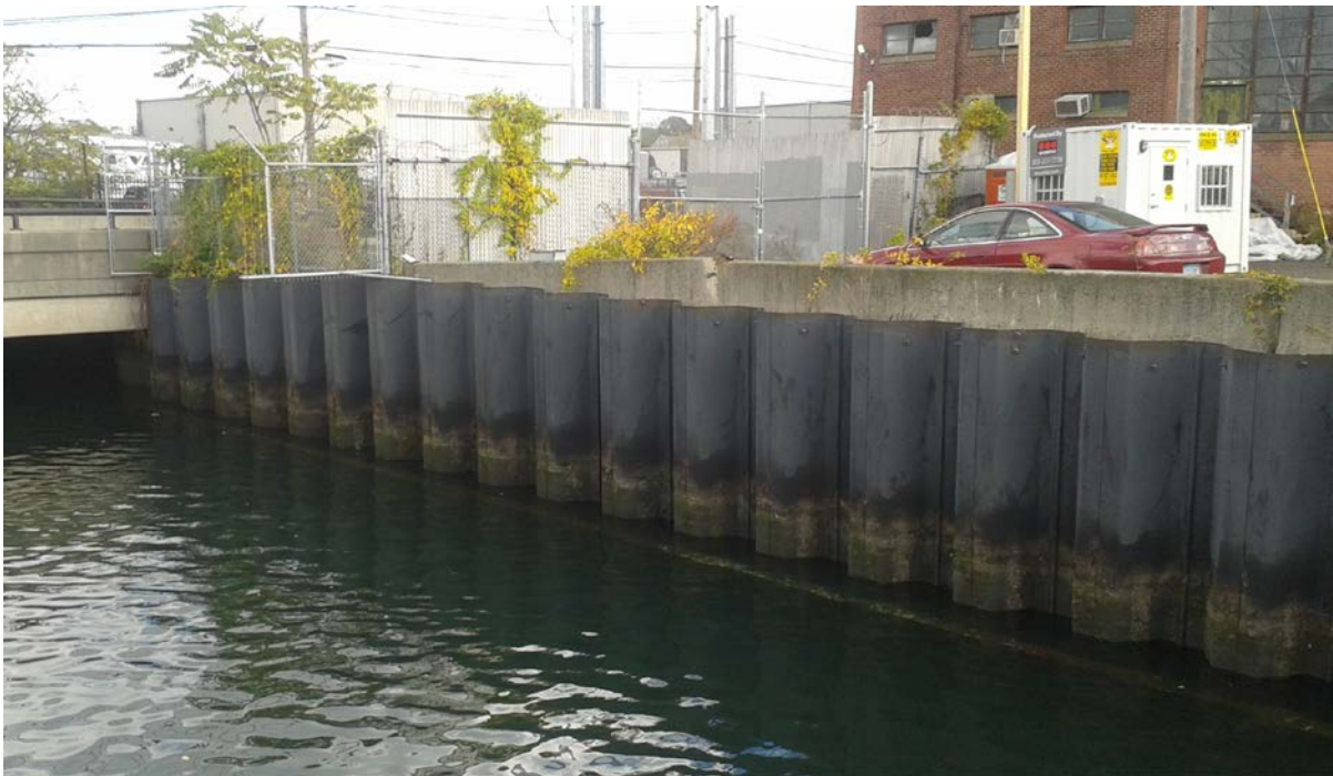
Photo 4 Phase 2 West at Grand Avenue