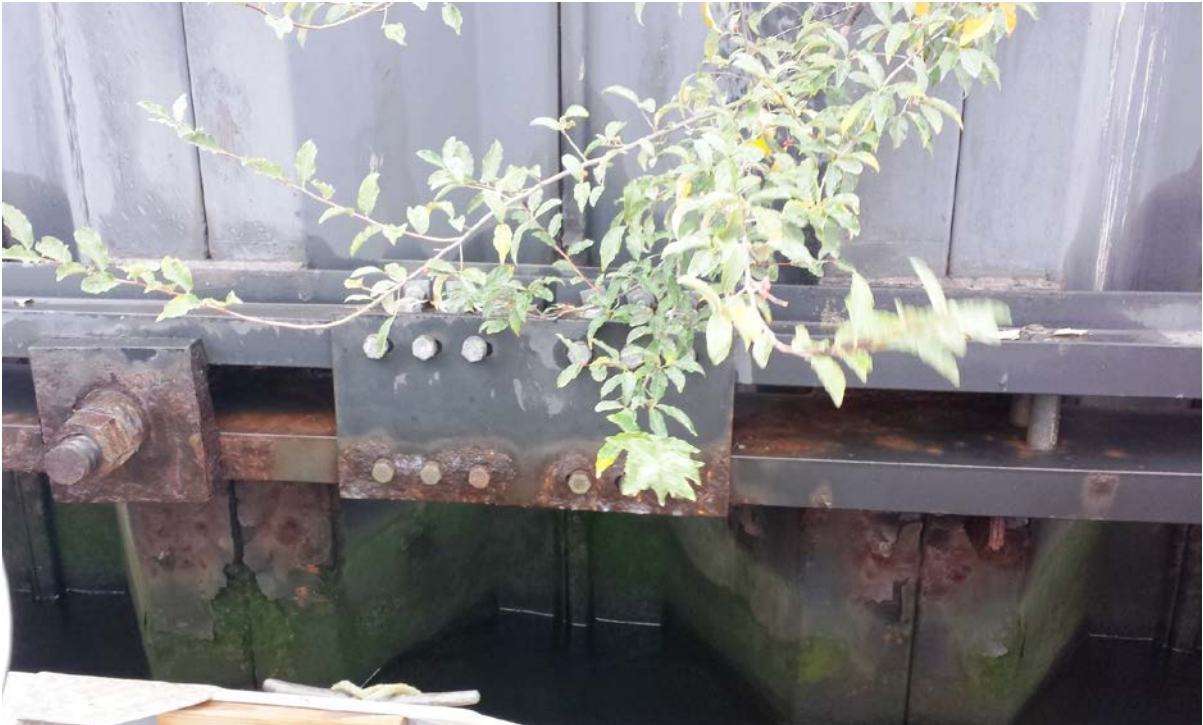
Photo 12 Typical Phase 3 bulkhead coating deterioration and corrosion onset in the tidal and splash zones – note horizontal tiebacks at southeastern high tension pole area do not have corrosion protection end caps