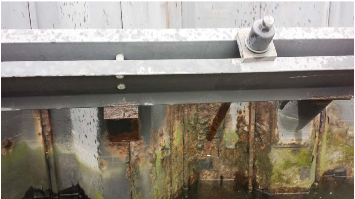
Photo 11 Phase 3 East, typical coating deterioration localized in the splash zone, primarily at field welds with coating touch-ups