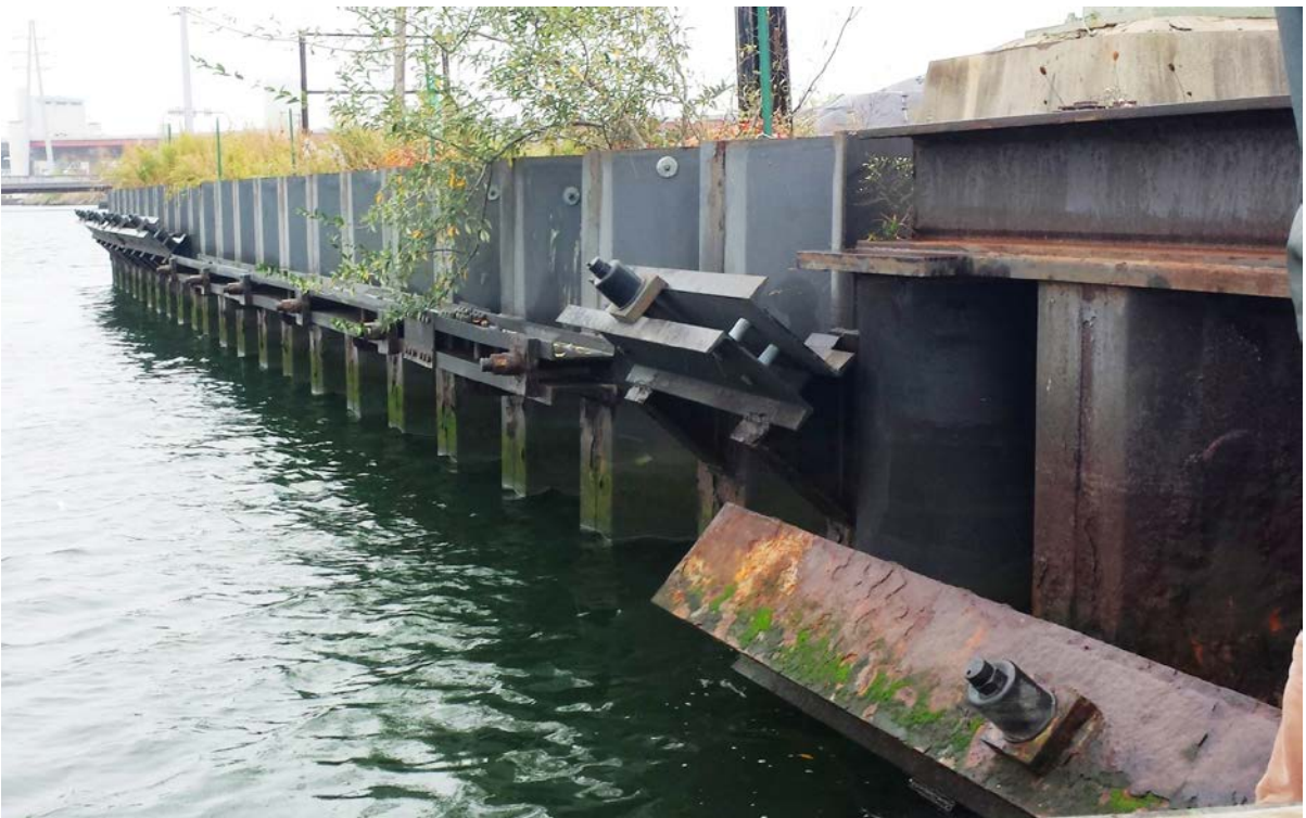
Photo 13 Phase 3 Southeastern area with varying configurations and degrees of coating deterioration, Unit 8 discharge area bulkhead (right side) appears to have had minimal coating with more extensive coating loss