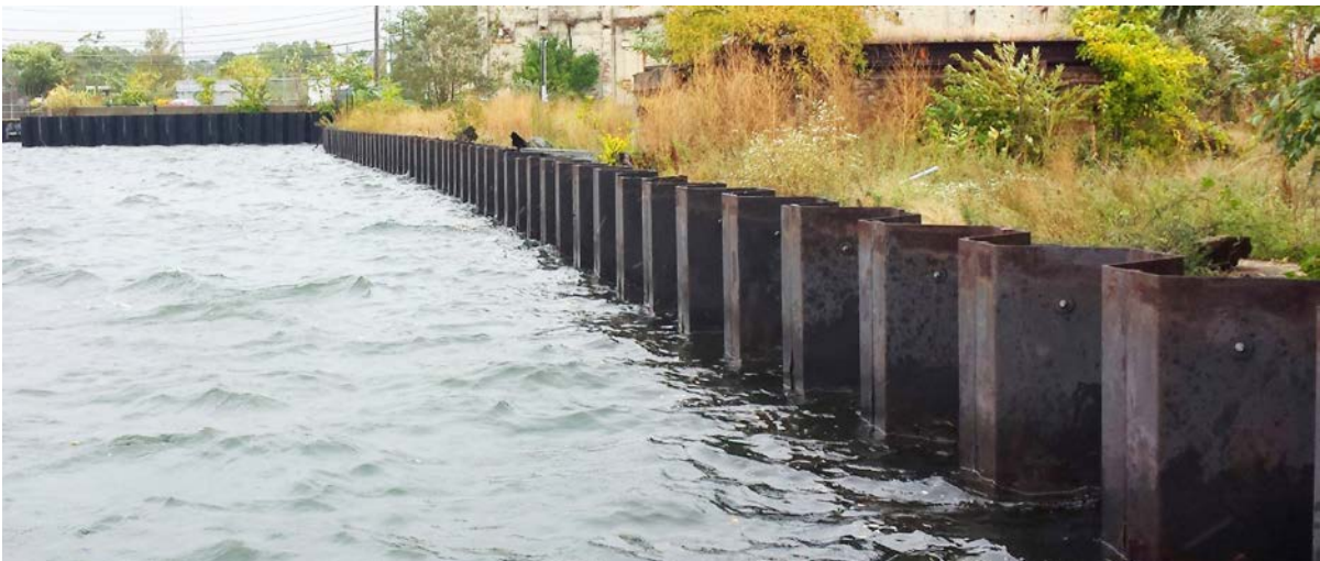
Photo 2 Phase 1 Bulkhead, minor coating deterioration offshore face