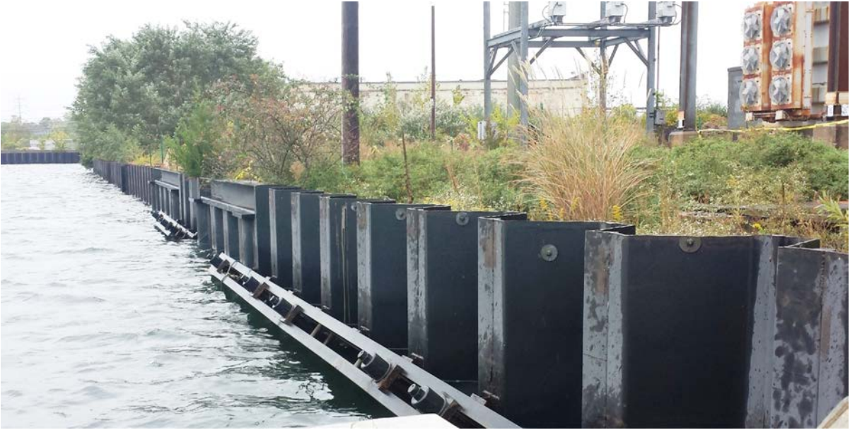
Photo 19 Phase 3 Western bulkhead at underwater cable crossing area (wales at the top of the bulkhead)