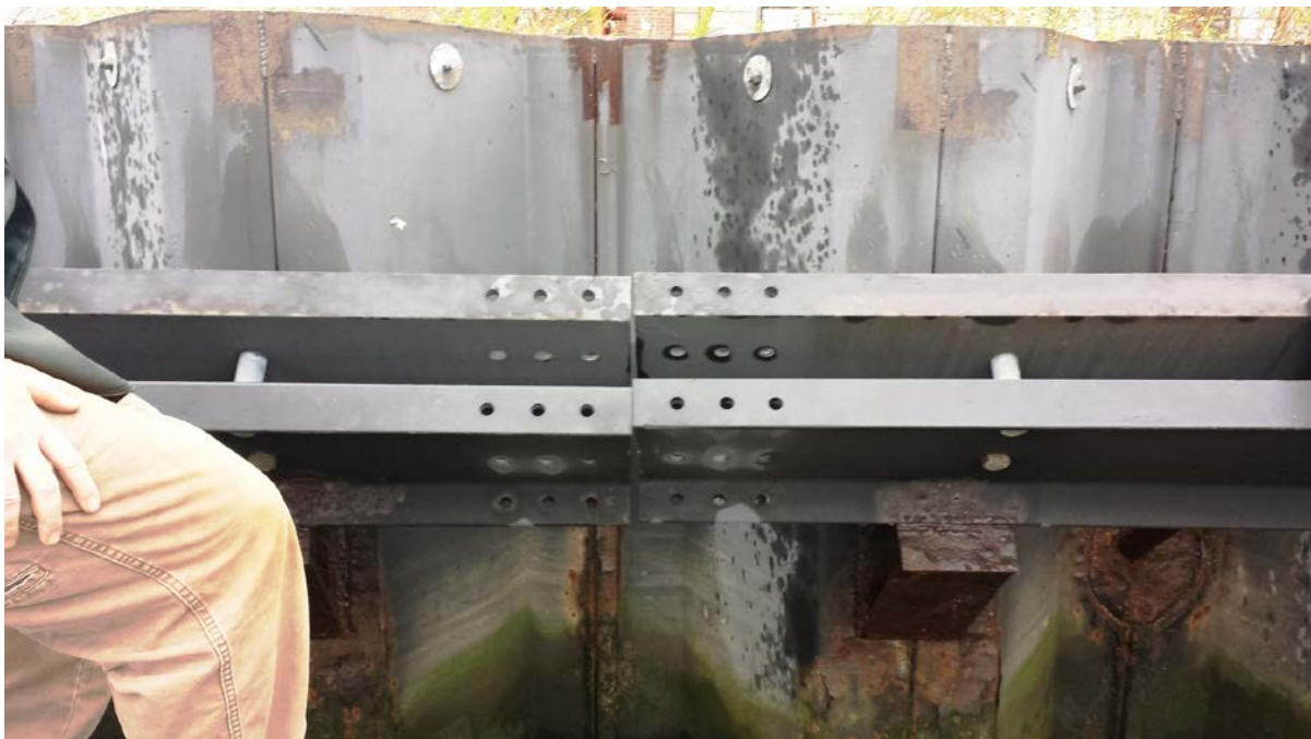
Photo 15 Phase 3 wale missing splice plates between Unit 7 and 8 discharge structures