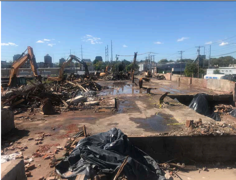
Photo 38: 9/17/2019, Consolidation and load out of Station B demolition debris.