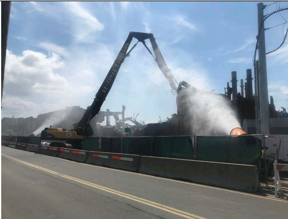
Photo 30: 8/22/2019, Demolition of the northern side of Station B.