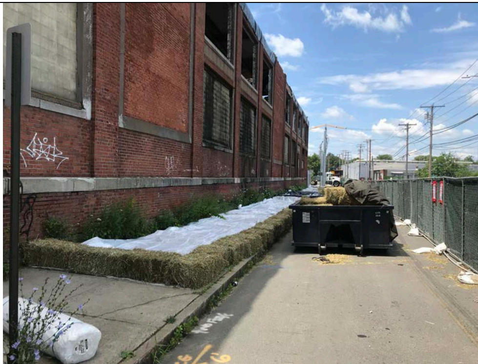
Photo 18: 7/24/2019, Regulated area for demolition debris on the northern side of Station B.