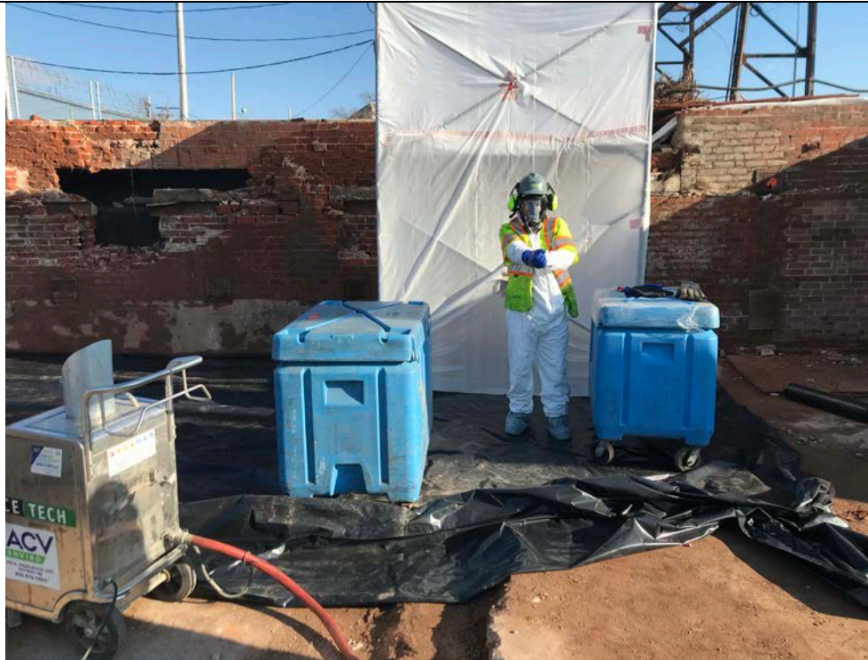
Photo 57: 1/15/2020, Contractor preparing to perform paint removal from permanent structures using ice blasting methods.