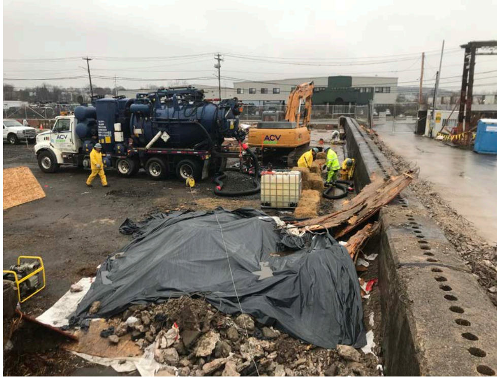
Photo 63: 2/6/2020, Fine cleaning of demolition debris waste near the former eastern platform wall.