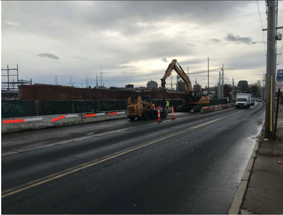
Photo 39: 11/20/2019, Realignment of Grand Ave traffic controls to allow pedestrian foot traffic on the south side of Grand Ave.