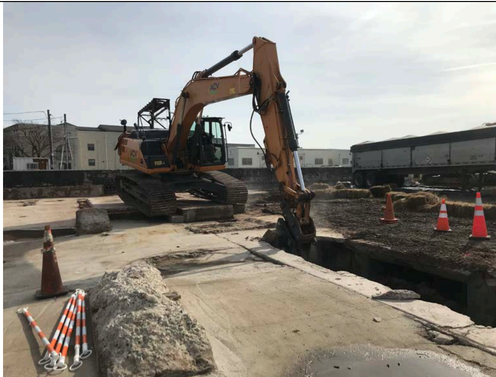
Photo 64: 2/12/2020, Investigation of the Station B cooling discharge tunnel. Demolition of the Station B basement floor slab/tunnel roof.