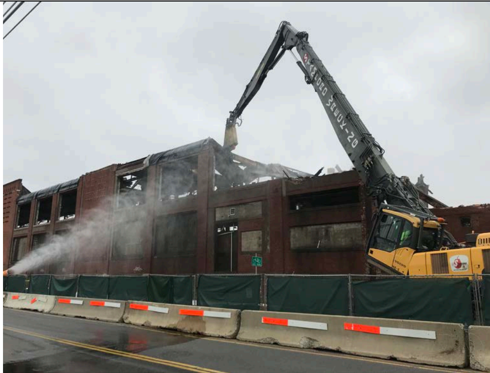
Photo 27: 8/14/2019, Demolition of the second-floor mezzanine on the northern side of Station B.