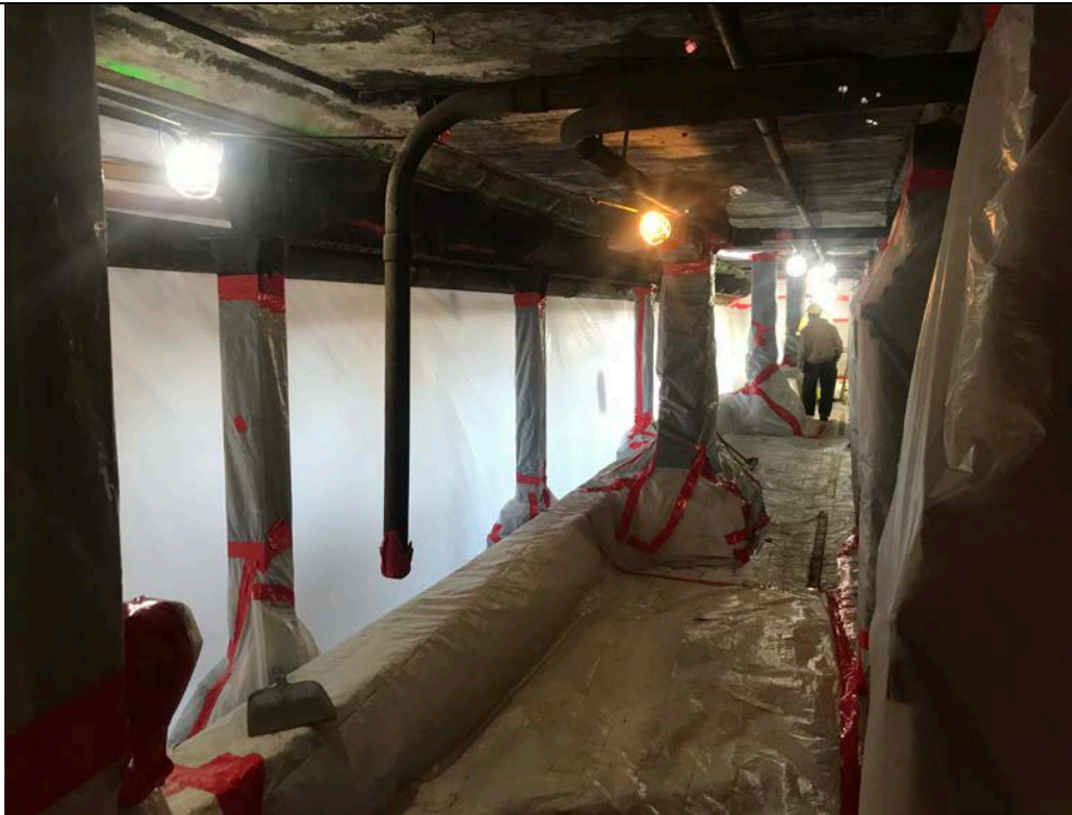
Photo 40: 11/21/2019, Station B basement, inside an asbestos abatement containment during preparation.