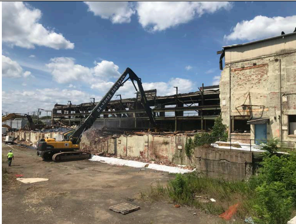
Photo 24: 8/9/2019, Demolition of the southern portion of Station B.