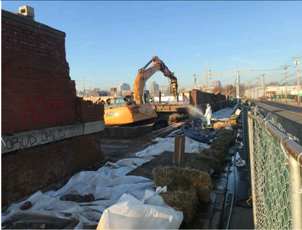
Photo 43: 11/26/2019, Demolition of the northern portion of the Station B first floor slab.