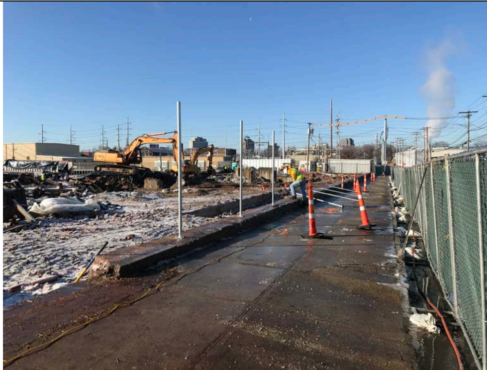
Photo 49: 12/18/2019, Installation of permanent site perimeter fence.