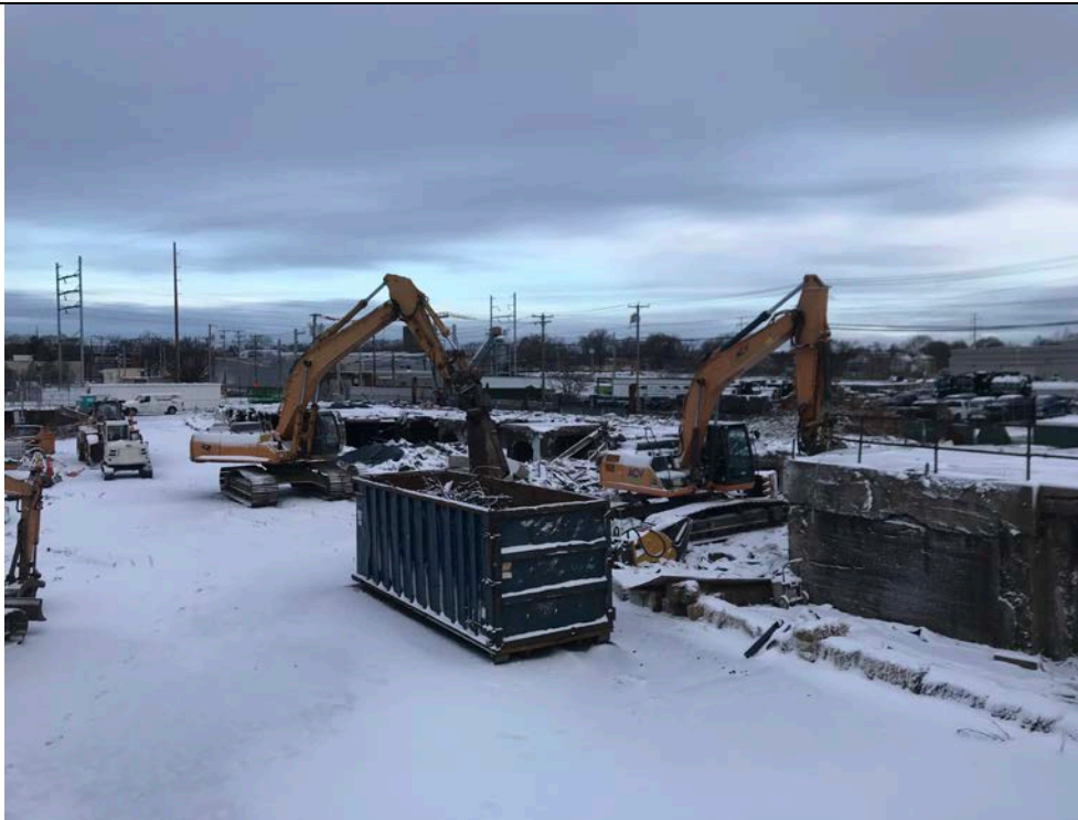
Photo 46: 12/3/2019, Station B demolition debris waste consolidation and load out.