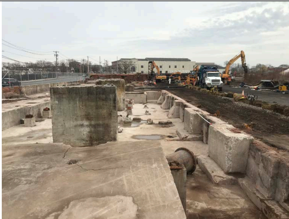
Photo 56: 1/14/2020, Eastern portion of the former Station B basement after fine cleaning of demolition debris waste.