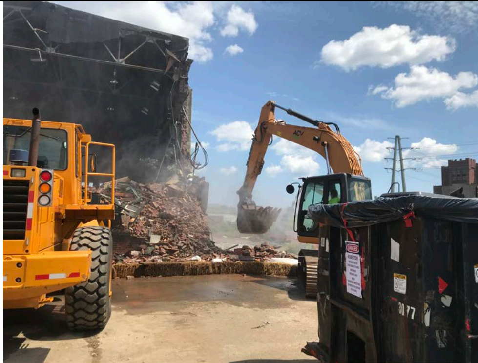
Photo 19: 7/24/2019, Consolidation of demolition debris waste near the southwestern corner of Station B.