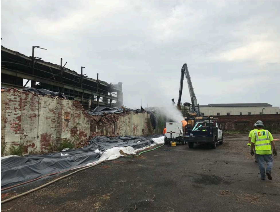
Photo 25: 8/13/2019, Demolition of the southeastern corner of Station B.