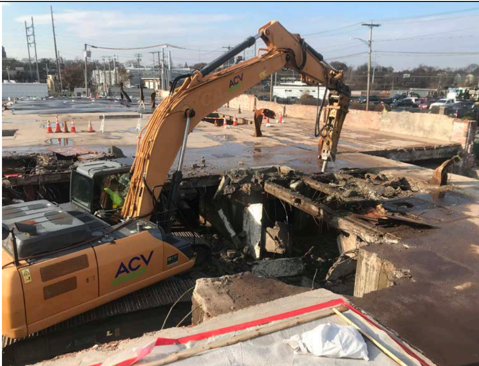
Photo 42: 11/25/2019, Demolition of the Station B first floor slab.