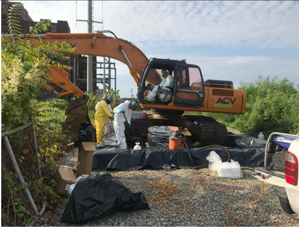
Photo 35: 9/9/2019, Decontamination of an excavator used during demolition activities, prior to being transported off-site.