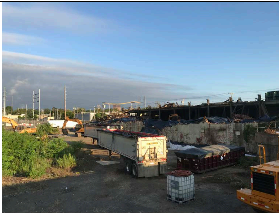
Photo 28: 8/16/2019, Station B demolition debris waste load out area on the southern side of Station B.