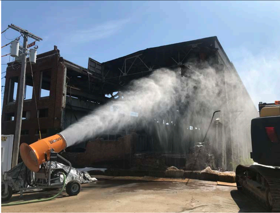
Photo 21: 8/9/2019, DustBoss® 60 (DB-60) water miser pre-wetting the work area at the southwestern corner of Station B for dust suppression.