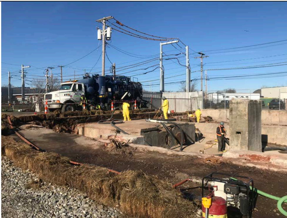
Photo 54: 1/9/2020, Fine cleaning of demolition debris waste in the former Station B basement.