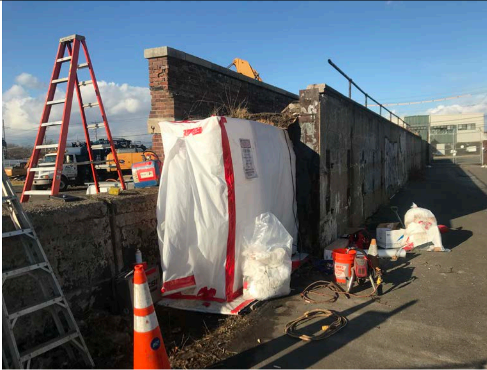
Photo 53: 1/8/2020, Asbestos abatement containment for asbestos containing material, prior to demolition of eastern platform wall.