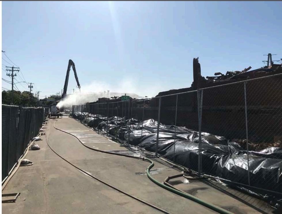
Photo 31: 8/26/2019, Regulated area for demolition debris on the northern side of Station B.