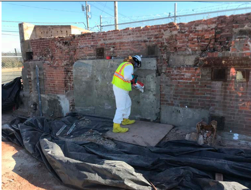
Photo 58: 1/17/2020, Porous media verification sampling for PCB analysis after paint removal.