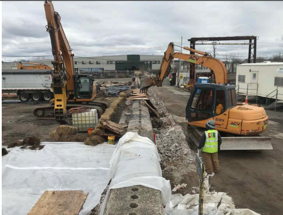
Photo 61: 1/28/2020, Demolition of the concrete portion of the eastern platform wall.