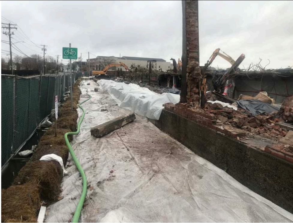
Photo 45: 12/2/2019, Regulated area for Station B demolition debris.