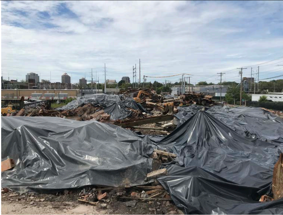
Photo 33: 8/27/2019, Poly sheeting used to cover debris piles at the end of each workday.