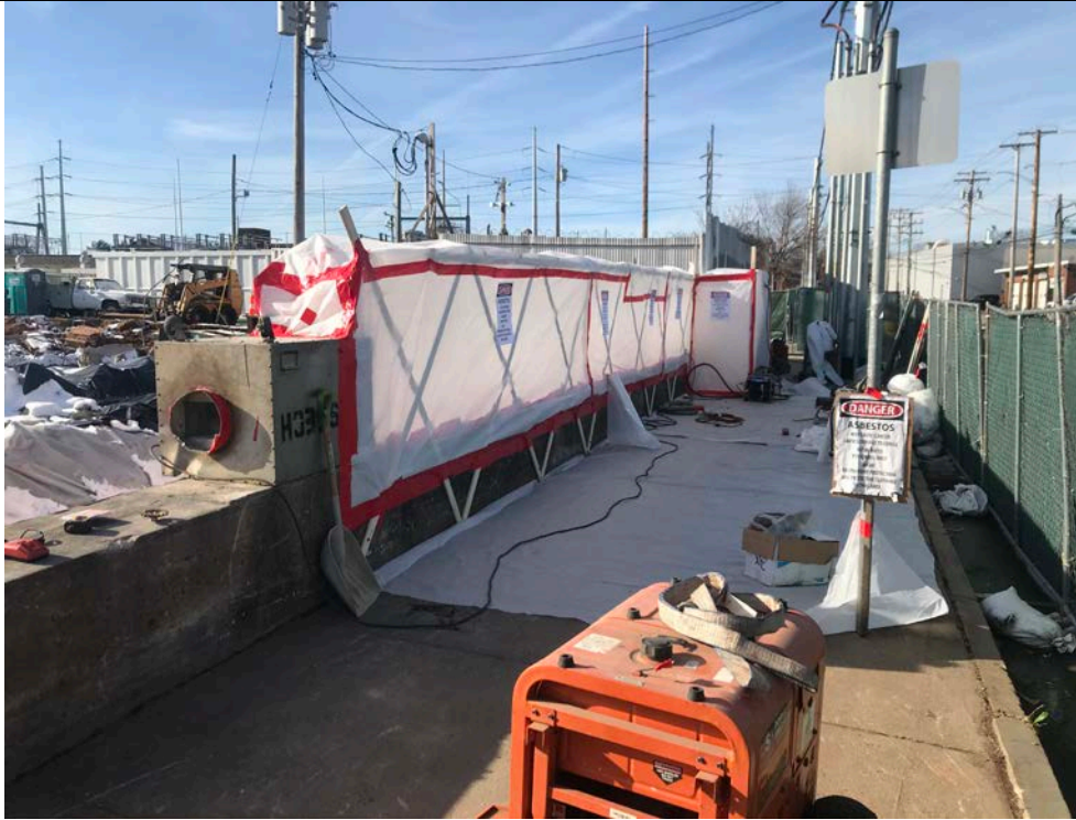
Photo 47: 12/12/2019, Asbestos abatement containment for the removal of asbestos containing material on the Station B permanent northern foundation wall.