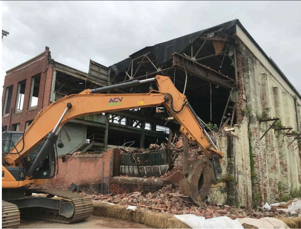
Photo 17: 7/23/2019, Demolition and consolidation of demolition debris at the southwestern corner of Station B.