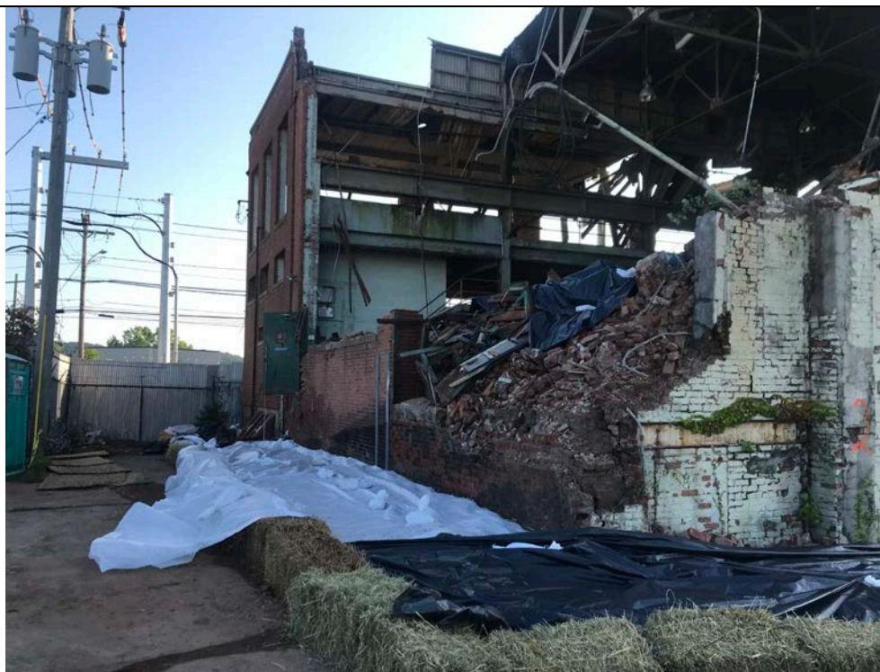
Photo 20: 7/25/2019, Regulated area for demolition debris at the southwestern corner of Station B.