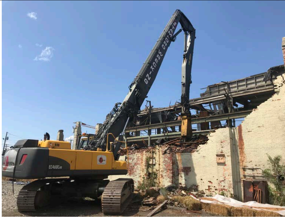
Photo 23: 8/9/2019, Demolition of the southern portion of Station B.