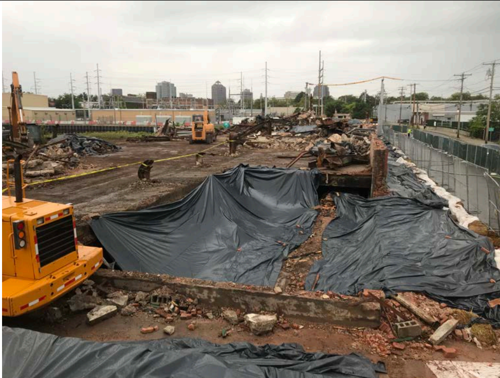
Photo 36: 9/12/2019, Poly sheeting used to cover consolidated concrete and brick debris piles at the end of each workday.