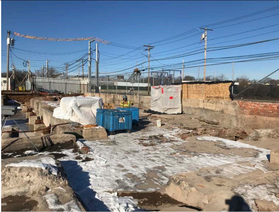
Photo 59: 1/21/2020, Dust suppression containment for paint removal using ice blasting methods.