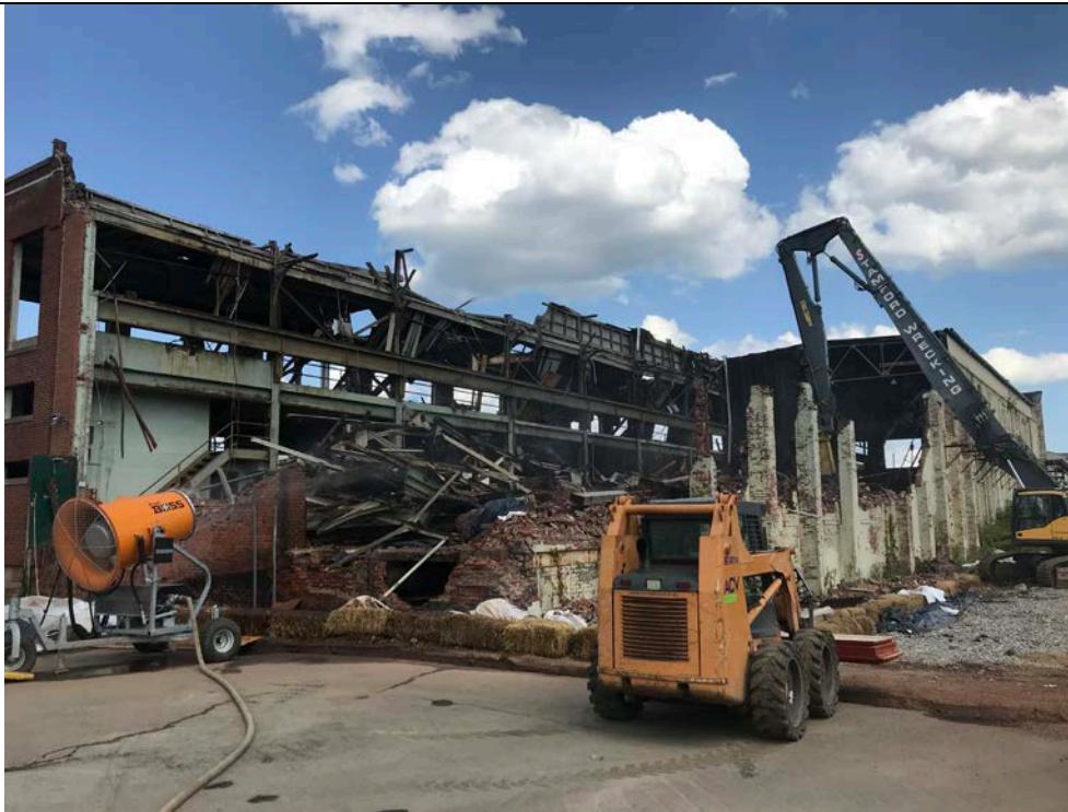
Photo 22: 8/9/2019, Demolition of the southern portion of Station B.