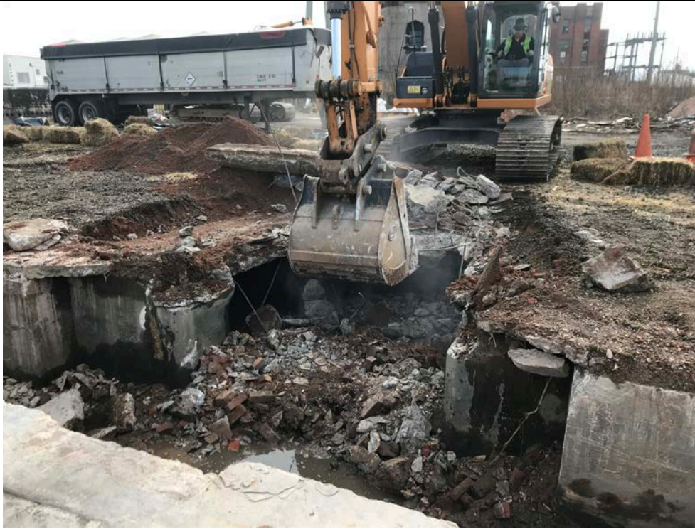
Photo 65: 2/12/2020, Investigation of the Station B cooling discharge tunnel. Demolition of the Station B basement floor slab/tunnel roof.