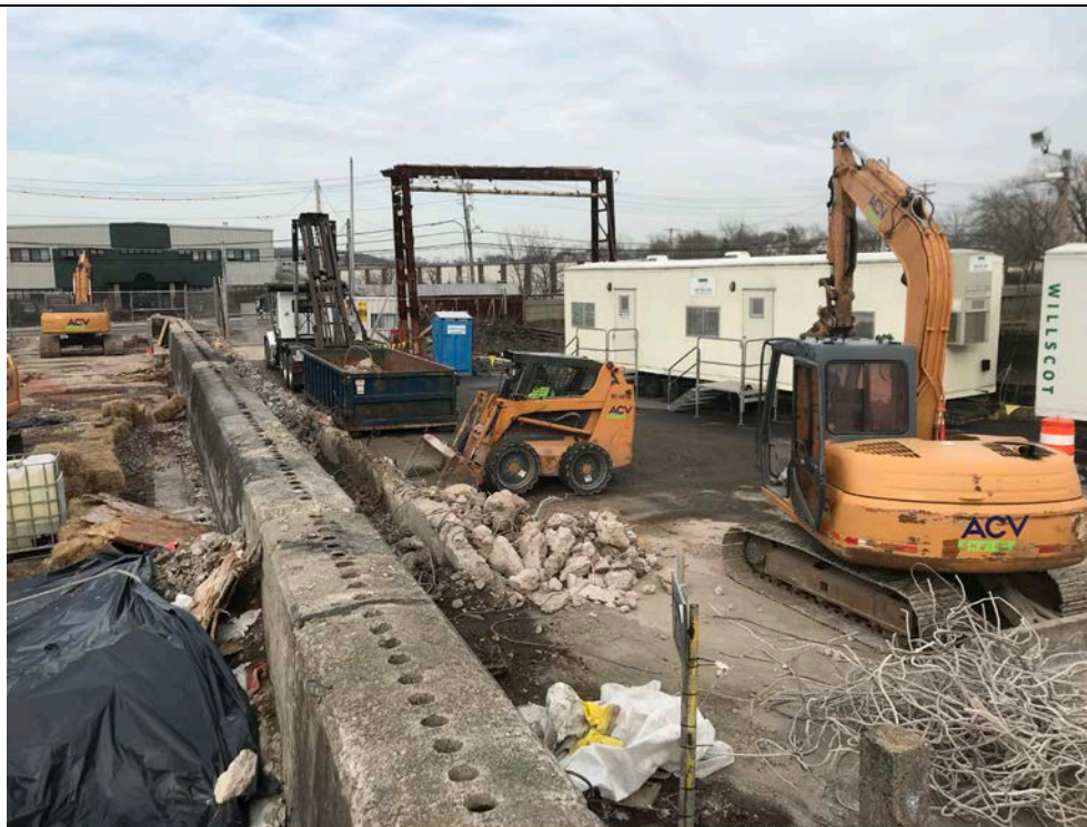
Photo 62: 2/4/2020, Demolition and consolidation of debris from the eastern platform wall.