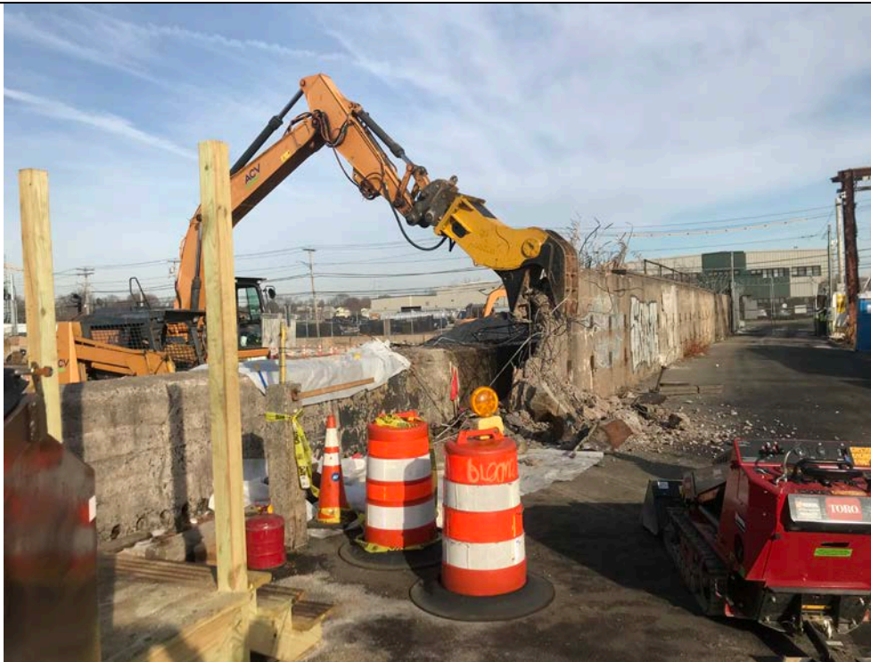
Photo 60: 1/23/2020, Demolition of the concrete portion of the eastern platform wall.